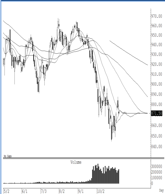
S50Z23 (Close 871.50 Chg -6.0)